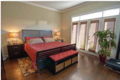
Private balcony in master suite