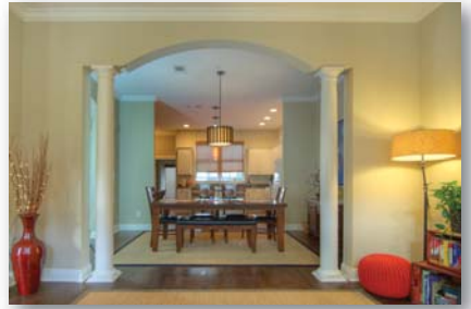
View from living room