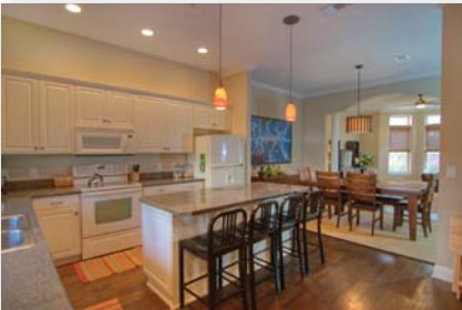
Open floor plan