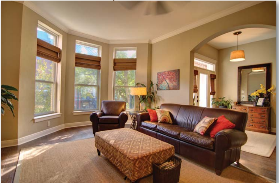
Bay window in living room

Regents Park is a 10 min bike ride or half hour walk to UF campus. 15 min bike ride to Shands Hospital.