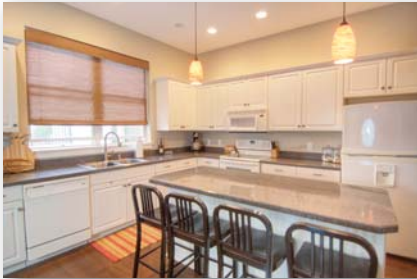
Large island in kitchen